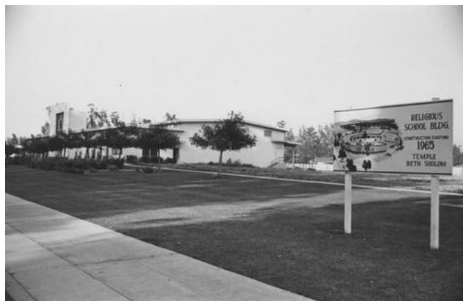
13031 Tustin Ave. TBS with sign for future RS building c. 1965